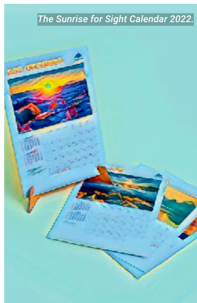
The Sunrise for Sight Calendar 2022.