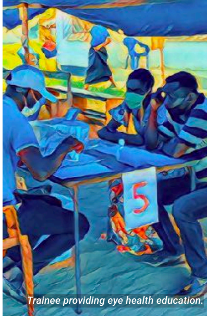
Trainee providing eye health education.