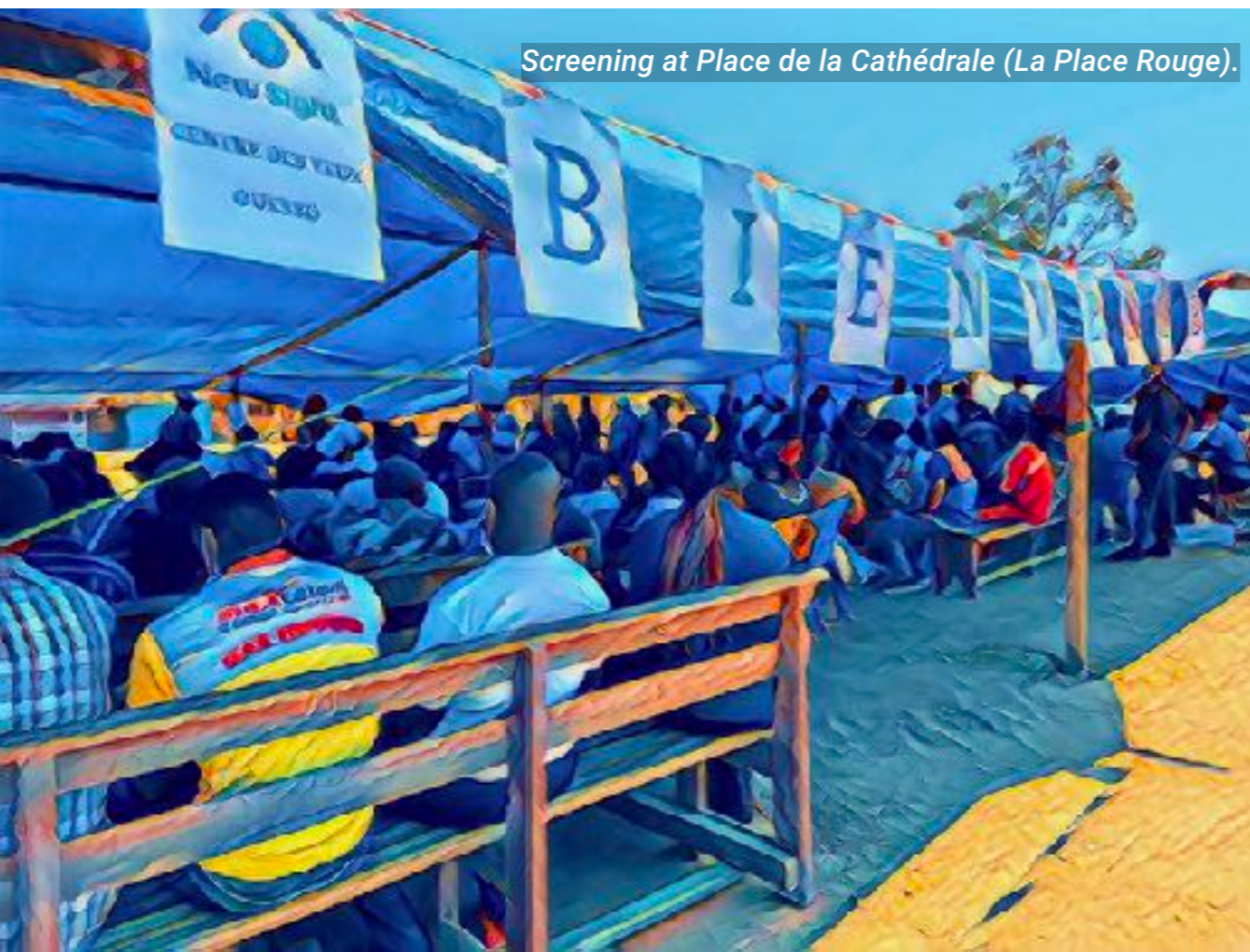
Screening at Place de la Cathédrale (La Place Rouge).