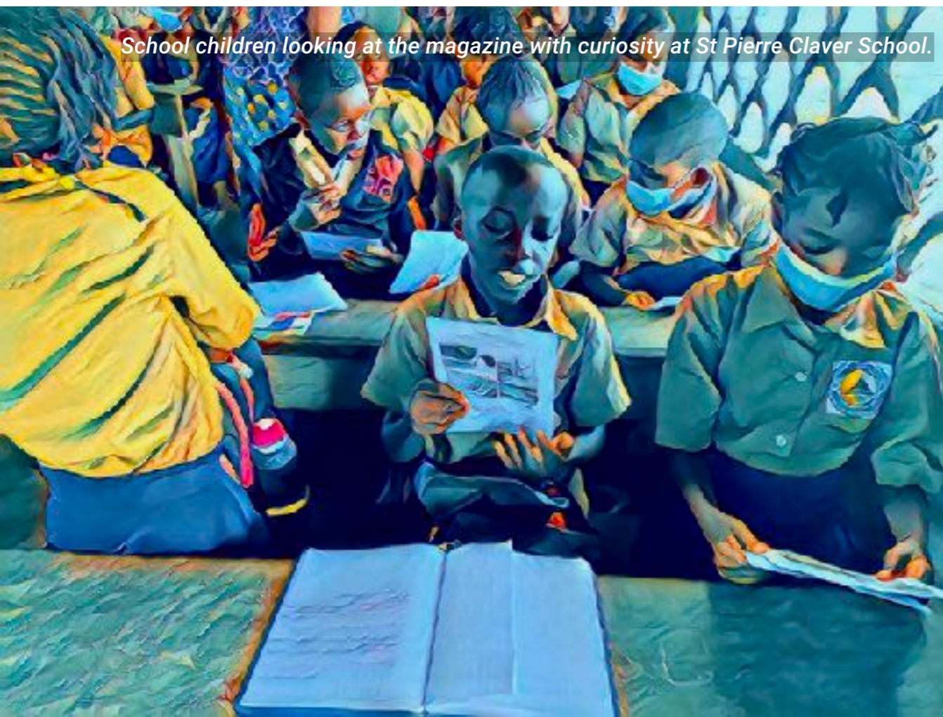
School children looking at the magazine with curiosity at St Pierre Claver School.