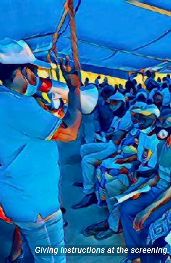
Giving instructions at the screening.