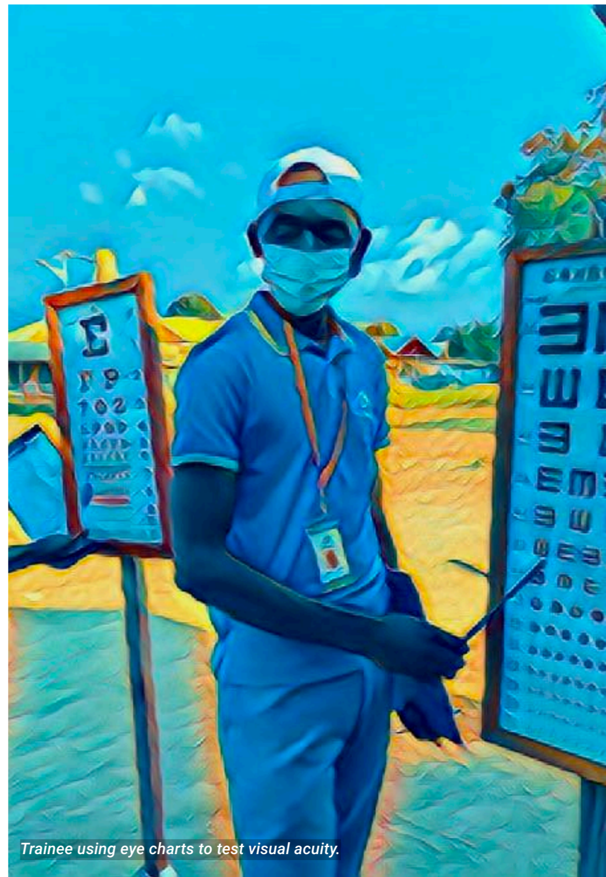
Trainee using eye charts to test visual acuity.