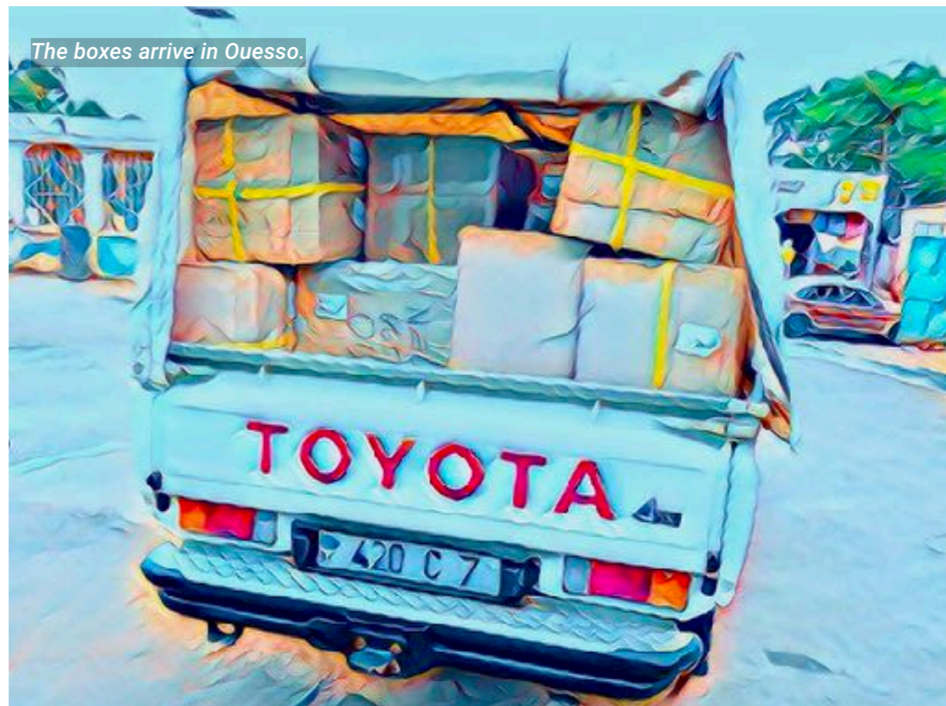
The boxes arrive in Ouessou.