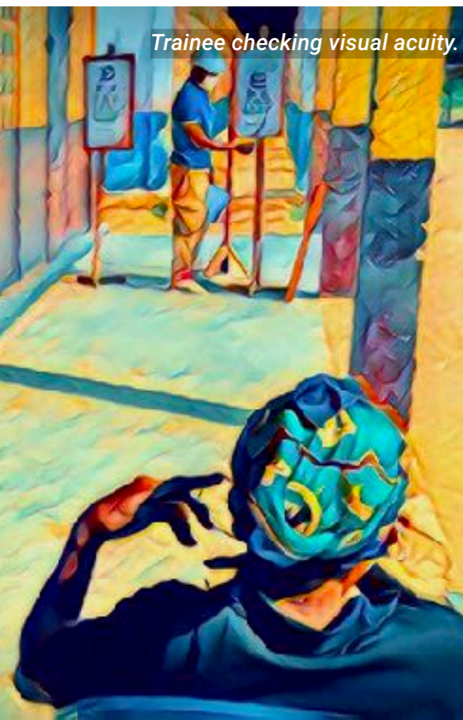
Trainee checking visual acuity.