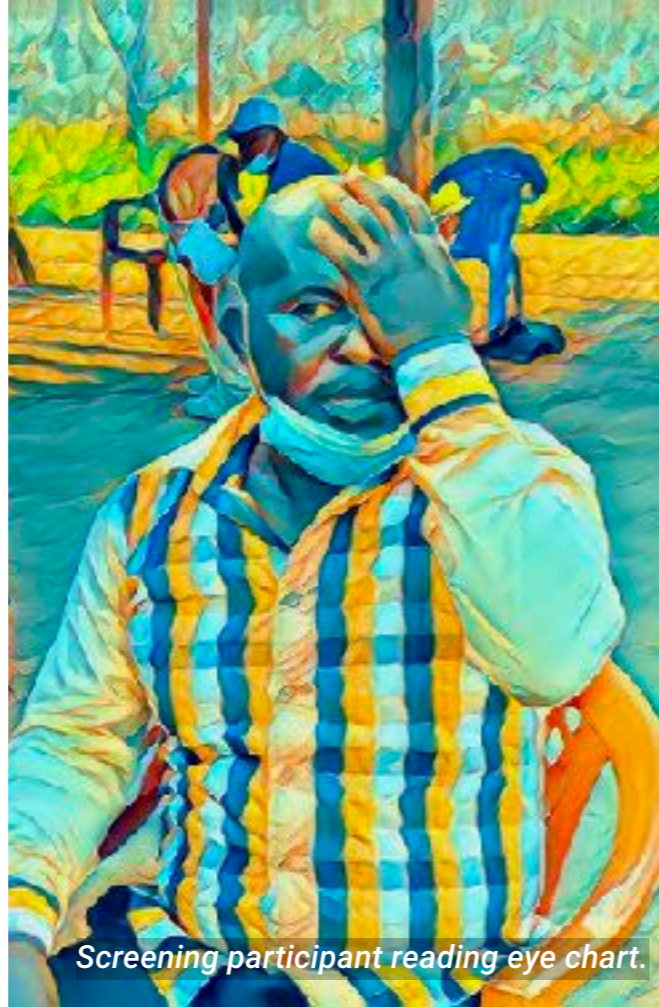
Screening participant reading eye chart.