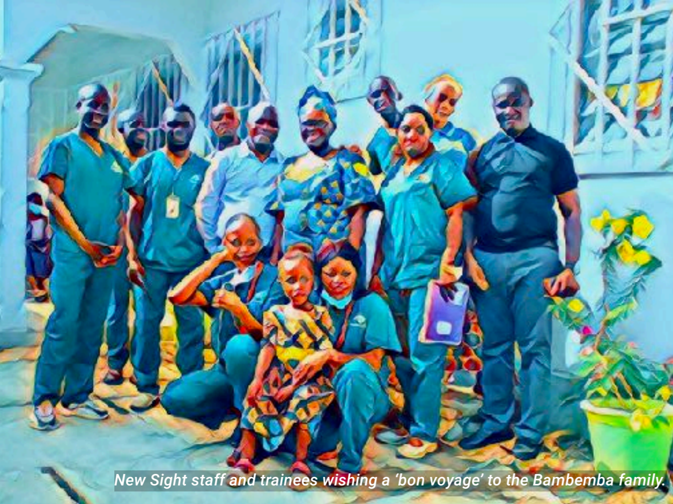
New Sight staff and trainees wishing a 'bon voyage' to the Bambemba family.