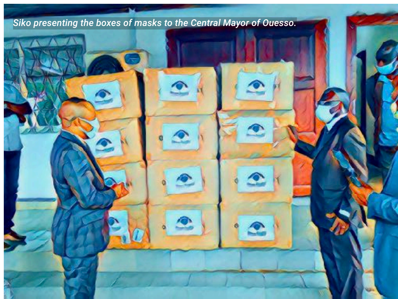
Siko presenting the boxes of masks to the Central Mayor of Ouessou.