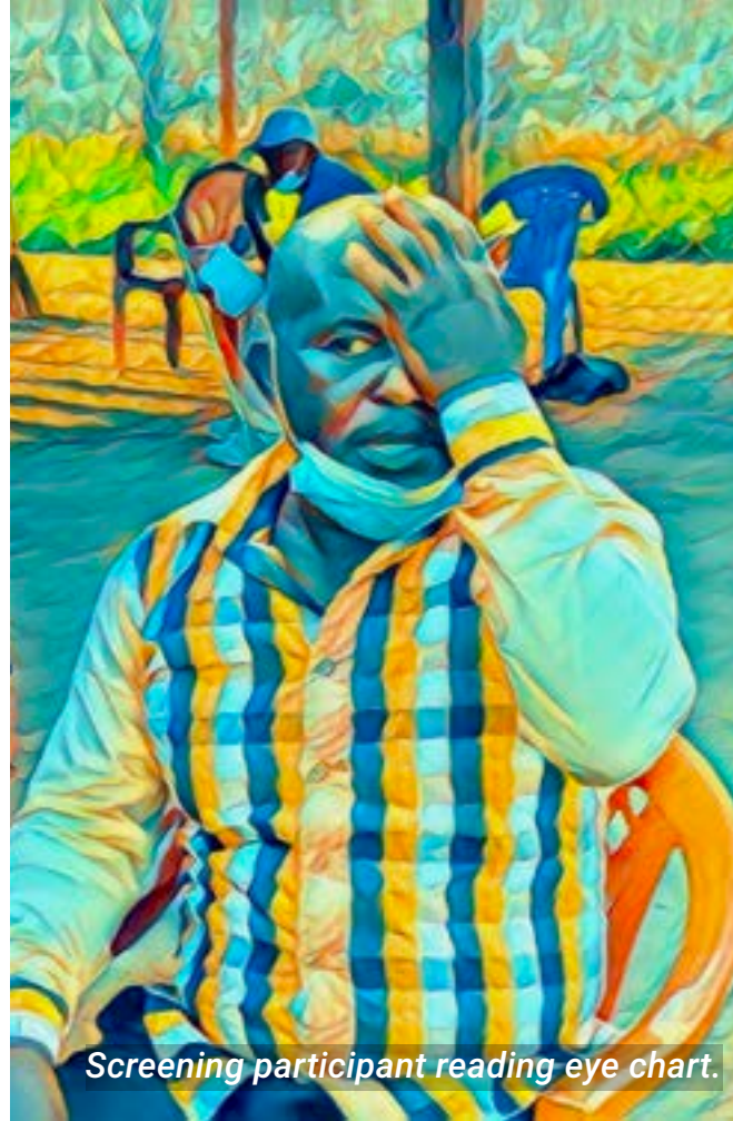
Screening participant reading eye chart.