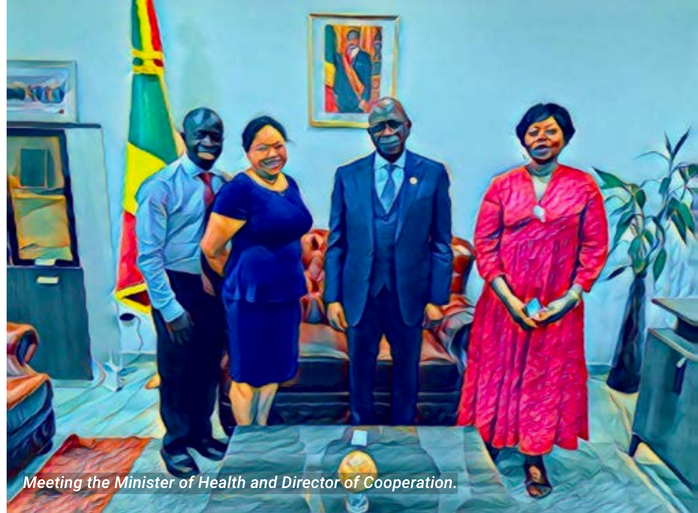
Meeting the Minister of Health and Director of Cooperation.

CHARITY COMMISSION REGISTRATION NUMBER: 1144893