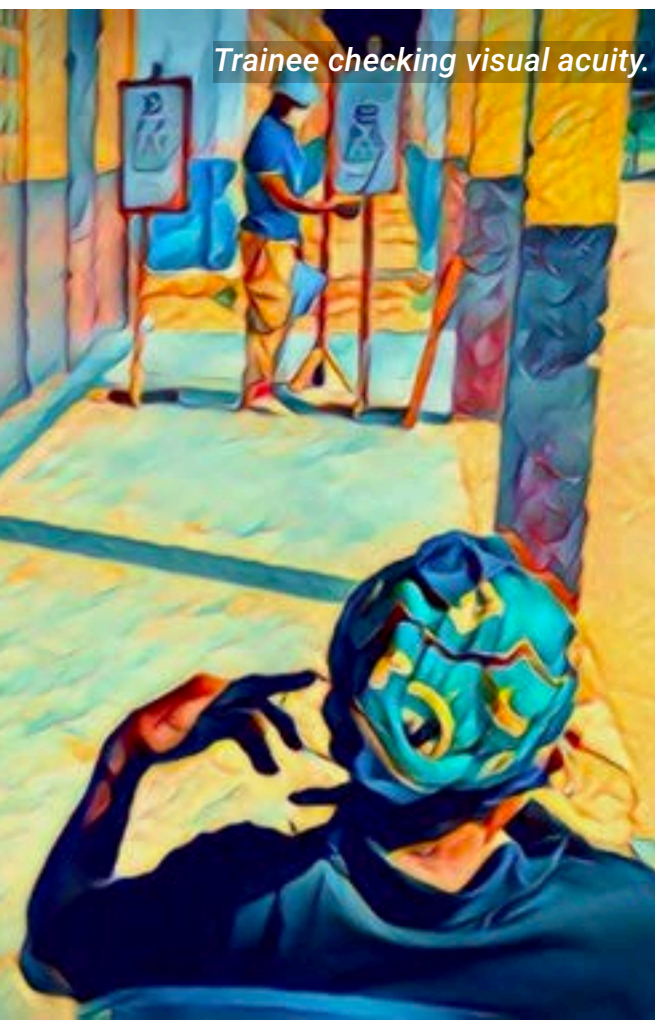
Trainee checking visual acuity.