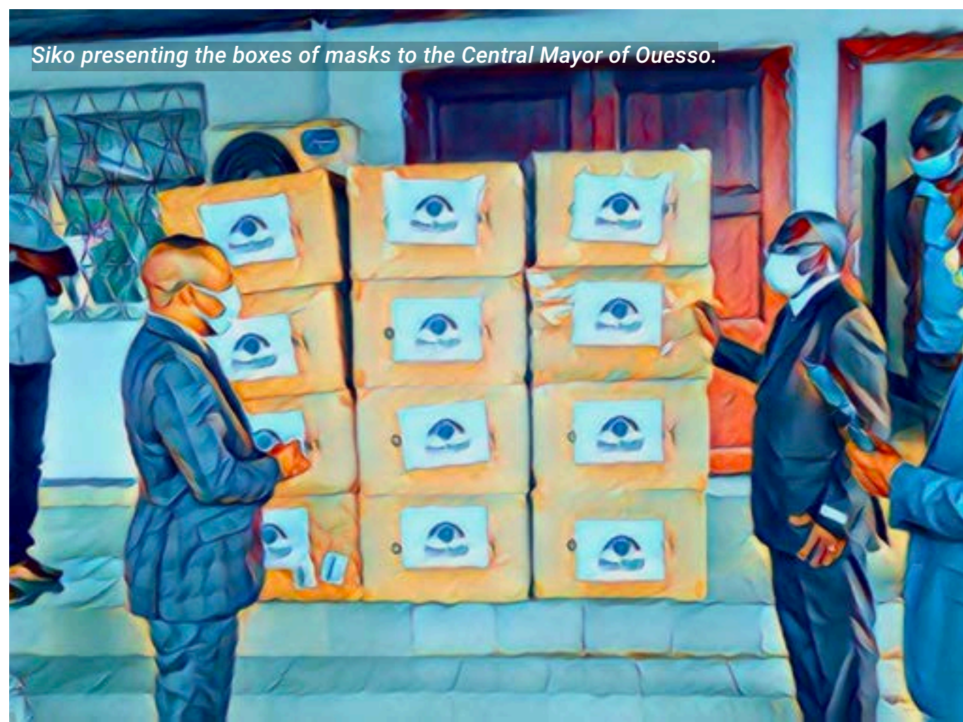
Siko presenting the boxes of masks to the Central Mayor of Ouessou.