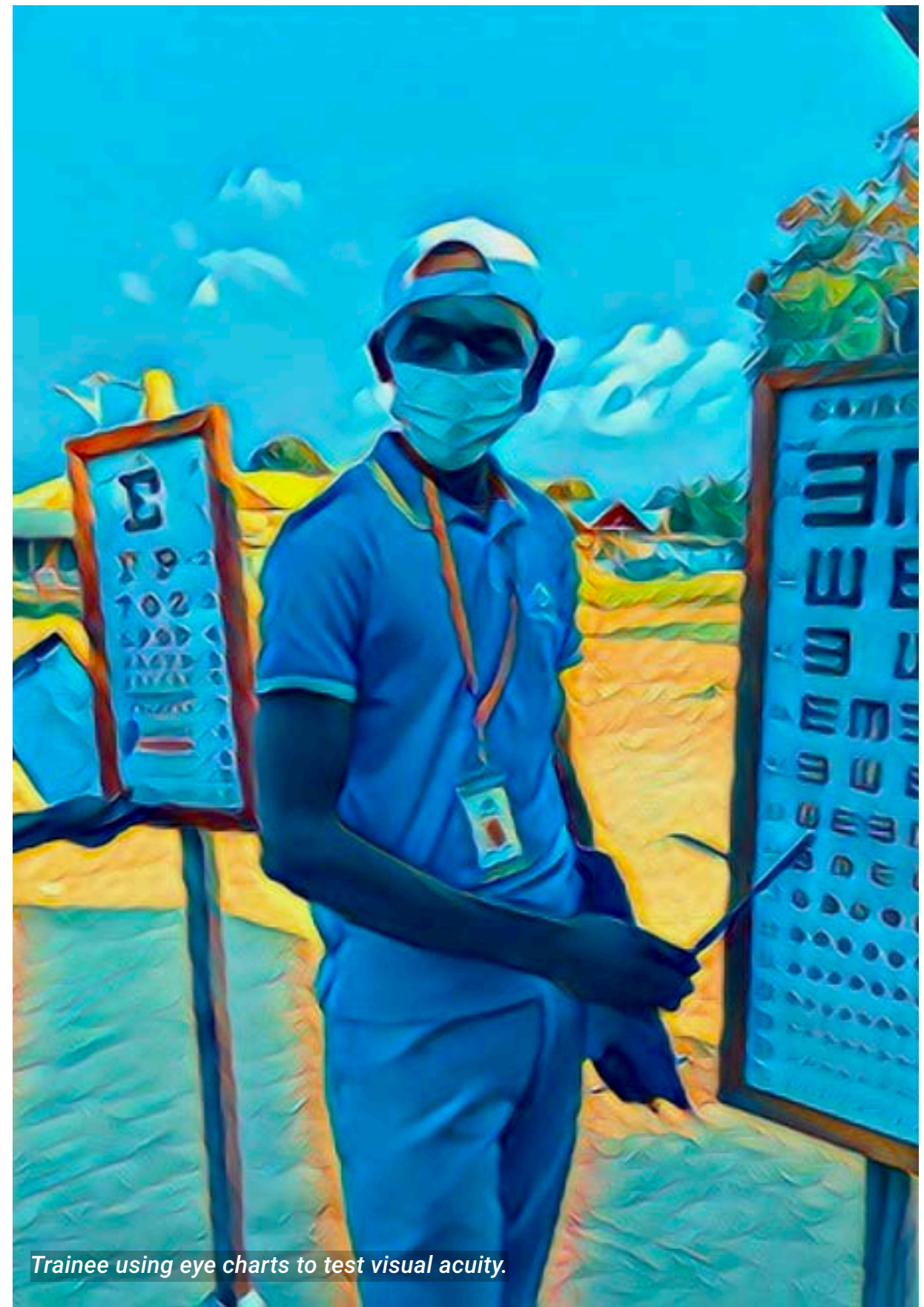
Trainee using eye charts to test visual acuity.