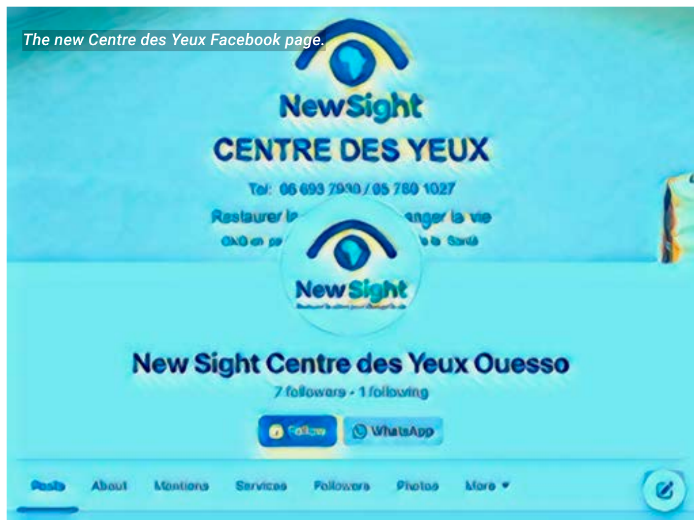
The new Centre des Yeux Facebook page.