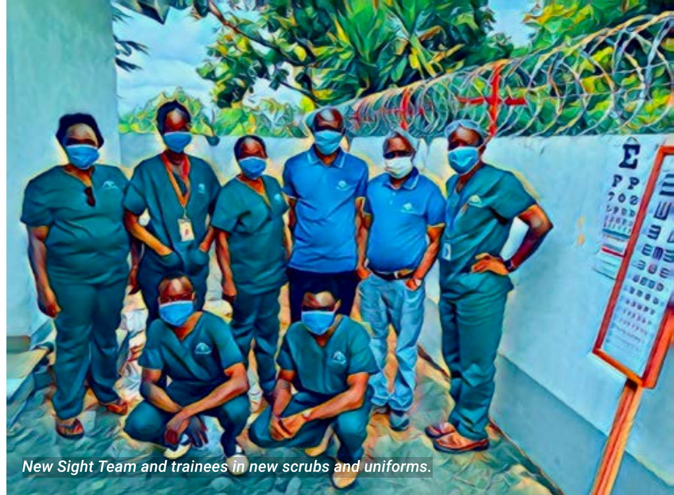
New Sight Team and trainees in new scrubs and uniforms.

A further 4 boxes of reusable masks and another donation of surgical masks from generous supporters were reserved for our staff and trainees to use at the Interim Eye Centre and for the staff and patients in our surgical mission to Impfondo. We continue to promote prevention in the community and ensure our staff and patients receive adequate personal protection.