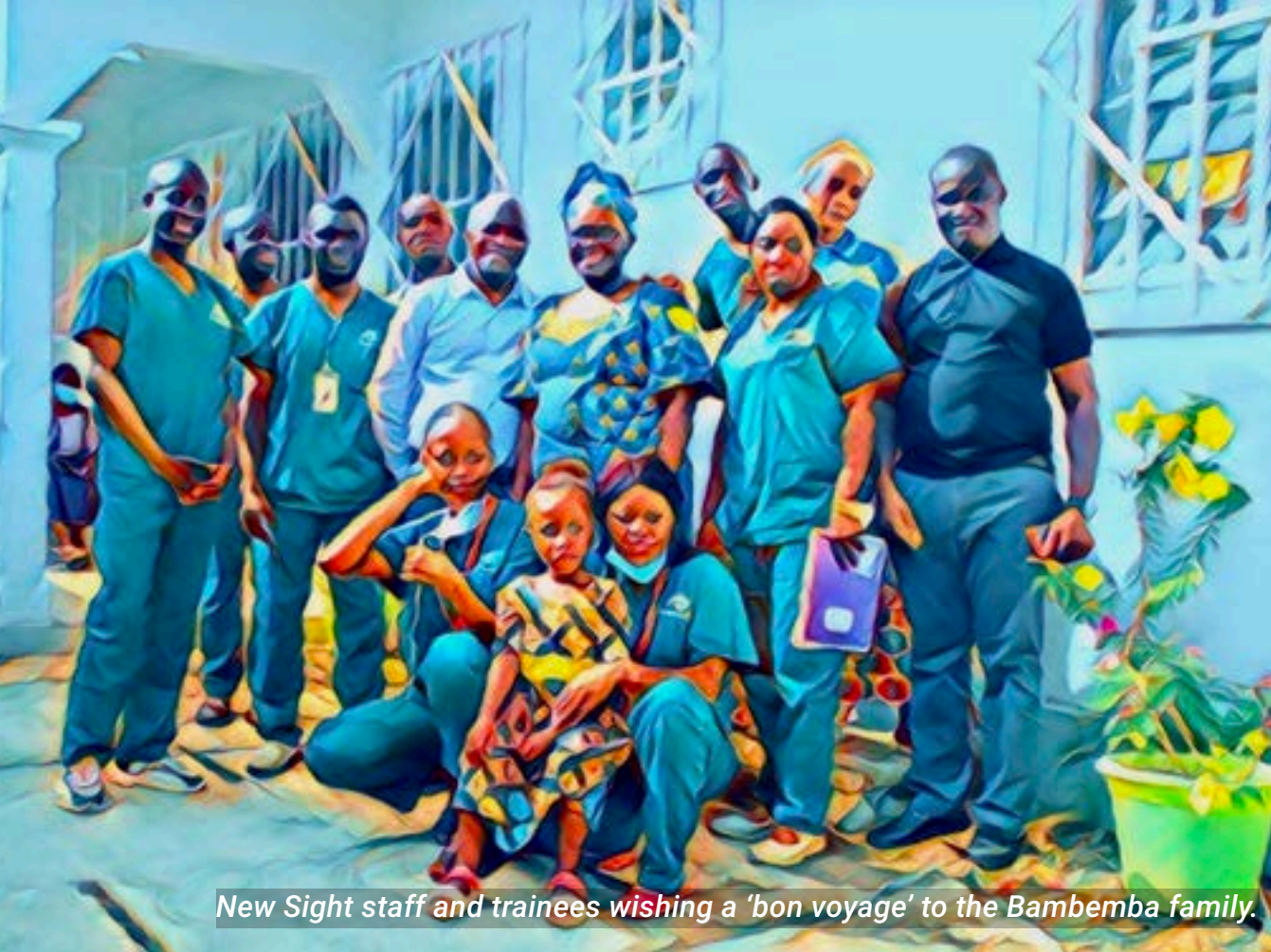
New Sight staff and trainees wishing a 'bon voyage' to the Bambemba family.