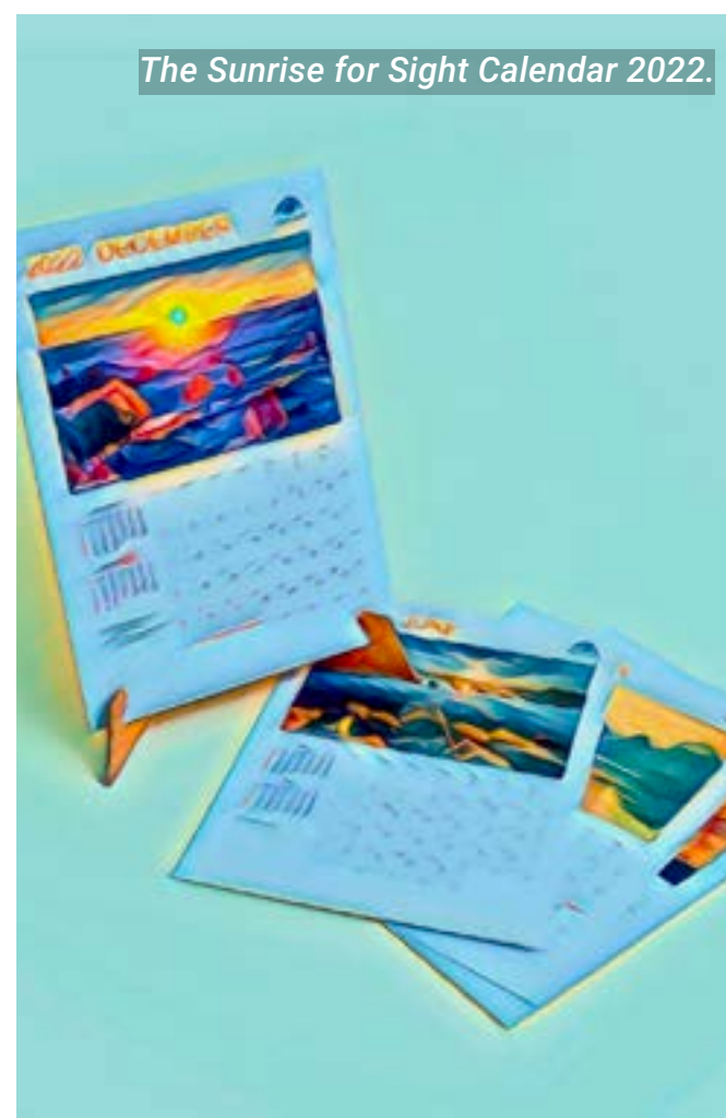
The Sunrise for Sight Calendar 2022.