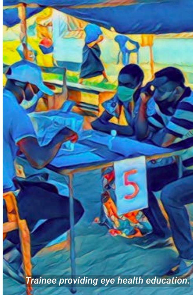
Trainee providing eye health education.