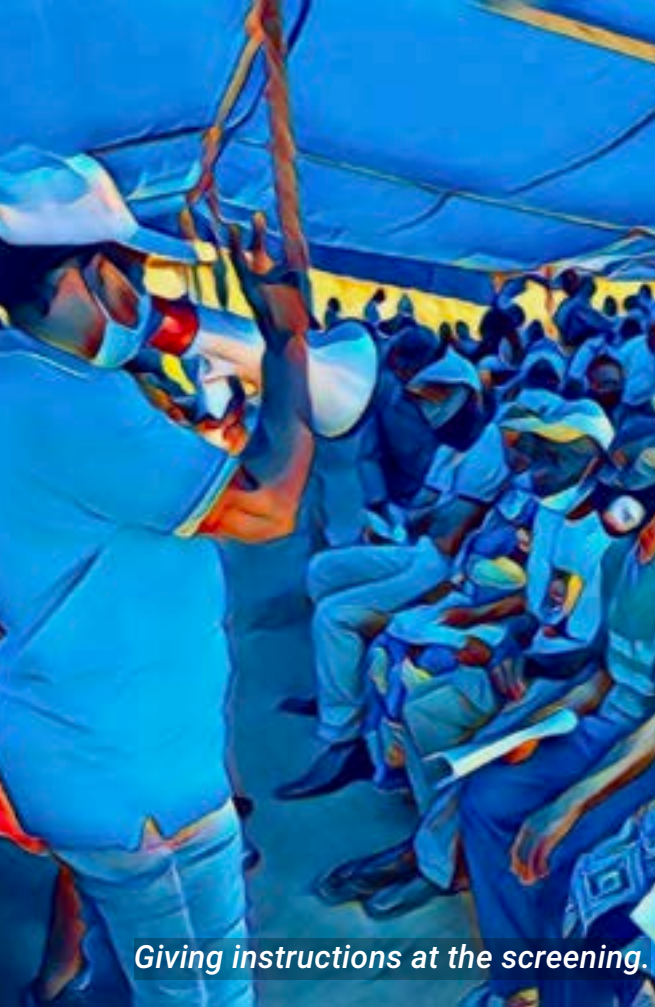
Giving instructions at the screening.