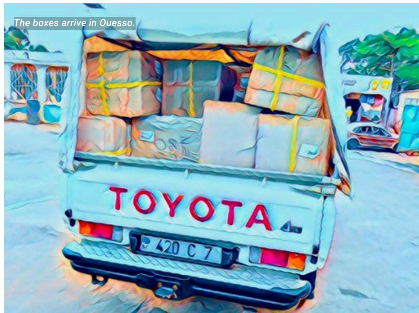
The boxes arrive in Ouessou.