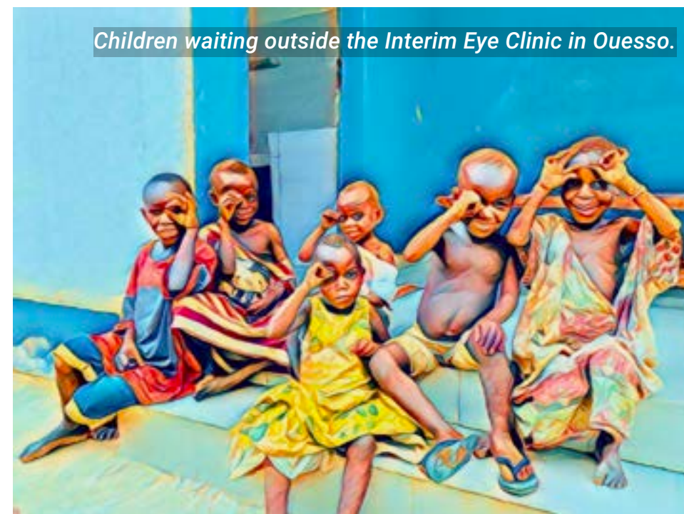
Children waiting outside the Interim Eye Clinic in Ouesso.

New Sight follows the technical guidance provided by the International Agency for the Prevention of Blindness in collaboration with the WHO to plan, budget and purchase the equipment and consumables needed. The bulk of our charity's surgery is to remove cataracts. Patients blind from cataracts can see again the day after this one-off operation.