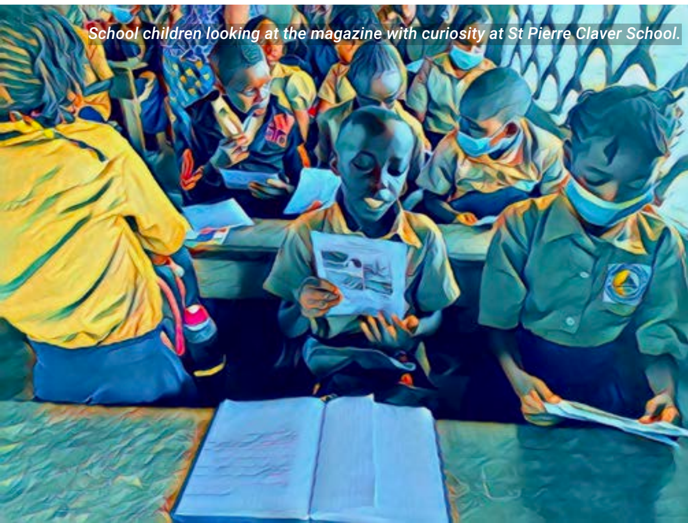
School children looking at the magazine with curiosity at St Pierre Claver School.