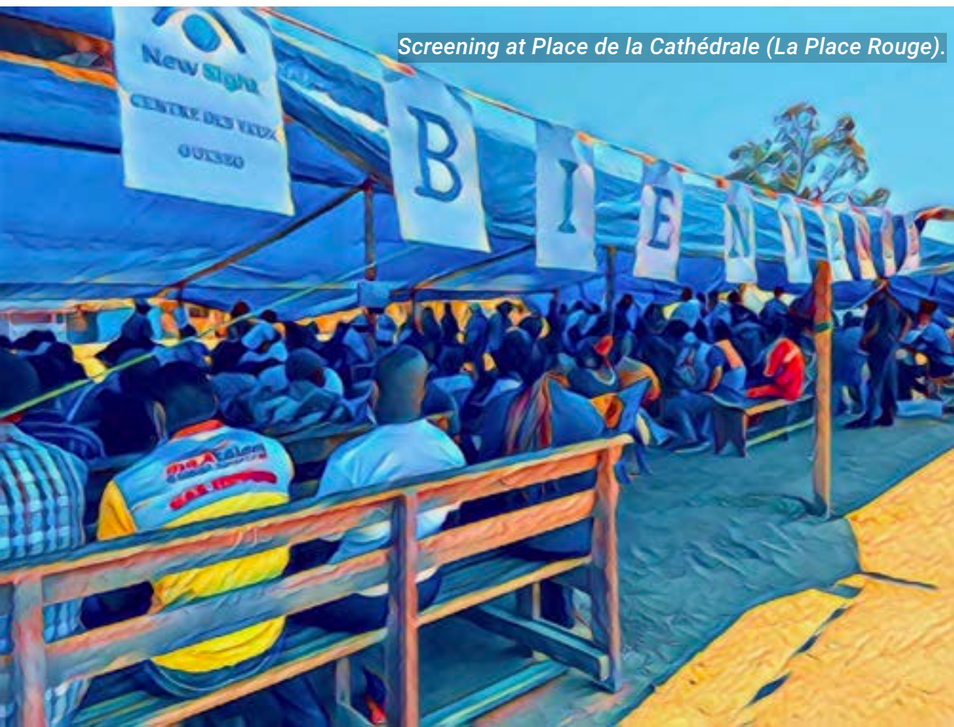
Screening at Place de la Cathédrale (La Place Rouge).