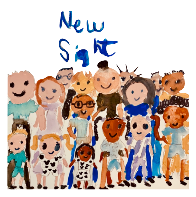
'Ouesso Pioneer Team' by Karis Faith Samoutou.

Three key goals for 2020/2021: 1. To provide accessible and comprehensive eye services; 2. Empower the local community; 3. Ensure sustainability by partnering with local and international partners.