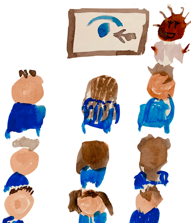
'A classroom full of student nurses' by Karis Faith Samoutou.

In January 2020, nine students who had completed the introductory course in October and November began the first one-year training course based at the IEC. They attend each day and receive a range of tuition including classroom-based theory and practical teaching in the IEC.