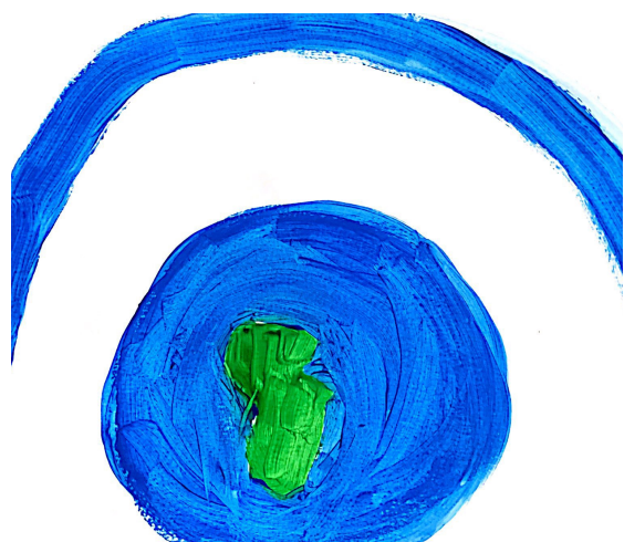
'New Sight Logo' by Karis Faith Samoutou.