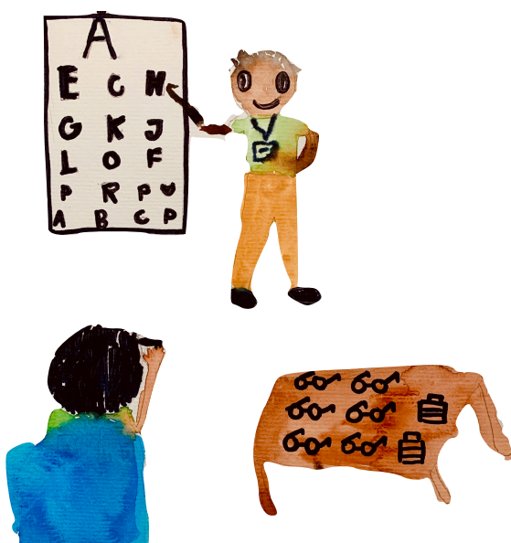
'Examining a patient's eyes' by Karis Faith Samoutou.

In order to improve New Sight services and better understand the needs of the community, each patient at the IEC has been invited to complete a feedback form. The responses received have been overwhelmingly positive. 100% positive reviews with 97% rating New Sight in the best category. New Sight is mindful that without the IEC, most patients would not have accessed the right help and could have ended up with much more serious problems.