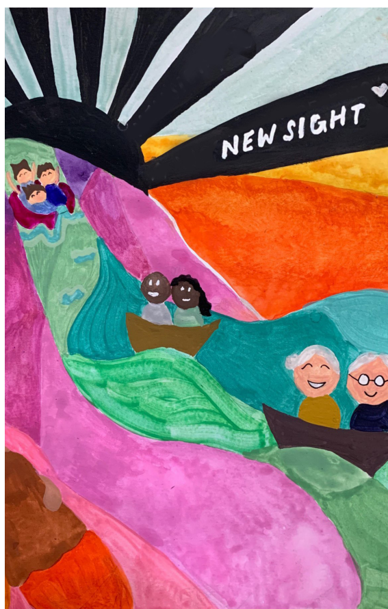
'A world where nobody is needlessly visually blind' by Megan Ng

In line with the United Nations Global Goals for Sustainable Development, the vision of the World Health Organisation, and the WHO Global Action Plan 2014-19, New Sight's Vision is: