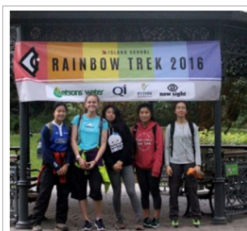
Students at the start of the Trek

From its inception in 2005, the Rainbow Trek has been