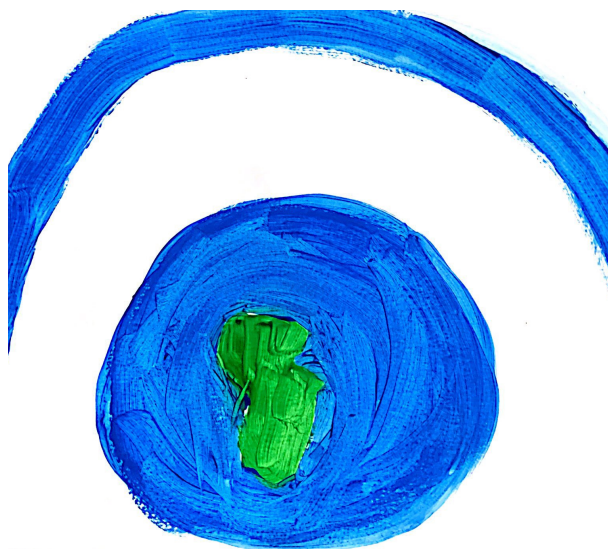
'New Sight Logo' by Karis Faith Samoutou.