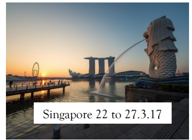
Singapore 22 to 27.3.17

The two of us can dream; A handful of us can plan; A dozen of us can work; But it takes an army of us to make it happen. - Joyce & Henri Samoutou