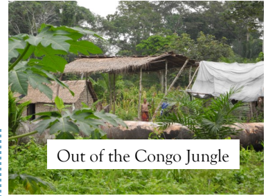
Out of the Congo Jungle

Alone we can do so little; together we can do so much. - Helen Keller